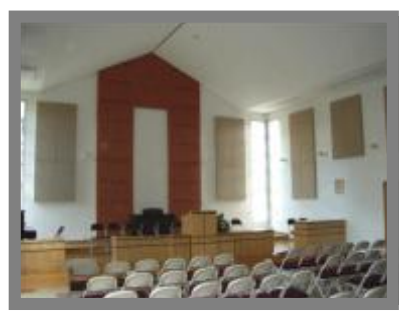
Gaia's Chapel - Church