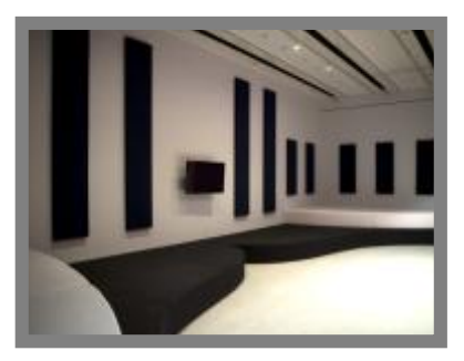
CCB Berardo Museum's - Amalia's Exhibition