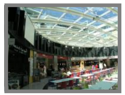
Central Park - Shopping Center