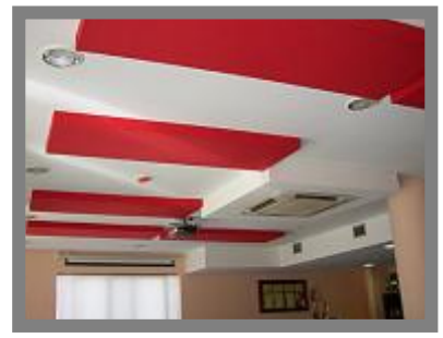
Quinta das Ceredeiras - Restaurant