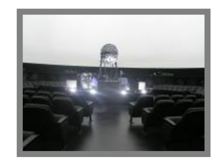
Planetarium - Calouste Gulbenkian