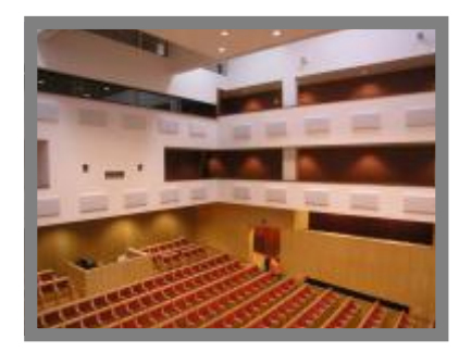
Augusto Cabrita's Auditorium