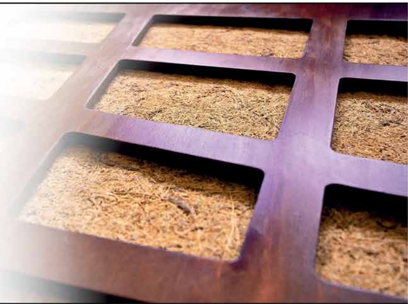
Image of 120x60cm model Ref.:ECOABLw (on the left) and Ref.:ECOABLw applied (ambient image) LFMT120 perforation on both images.