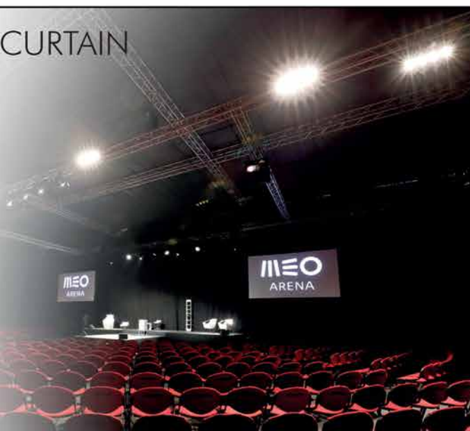
Image of 600x150cm model Ref.:BAC1506 and the model 800x150cm Ref.:BAC1508 applied (ambient image).