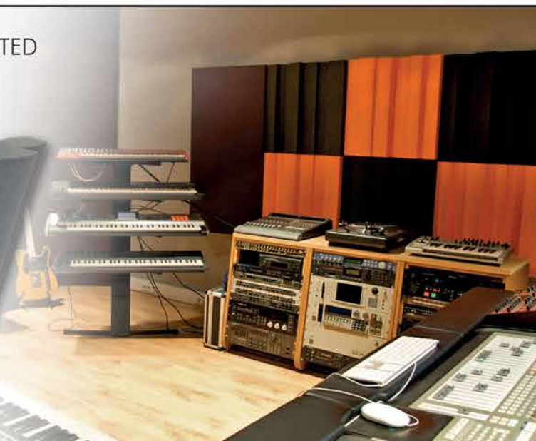
Image of 60x60cm models Ref.:FS0060 and Ref.:FSI060 (on the left) and Ref.:FS0060 and Ref.:FSI060 applied (ambient image).