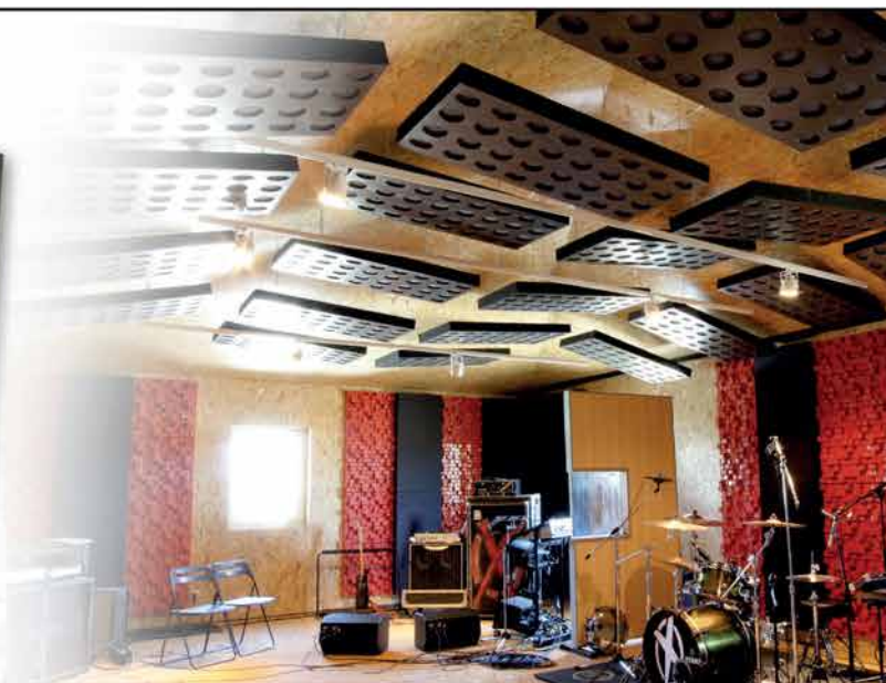
Image of 60x60cm model Ref.:LFM060 (on the left) and Ref.:LFM120 (ambient image)