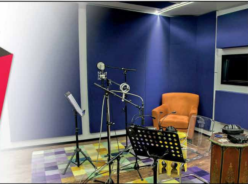
Image of 60x60cm model Ref.:LFA060 (on the left) and Ref.:LFA060 applied (ambient image).