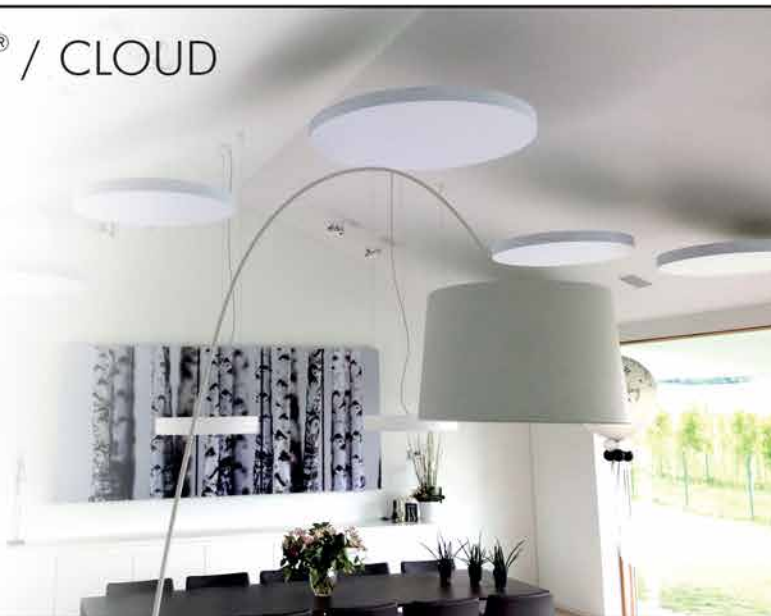
Image of 180x90cm, of the new 90x90cm cloud shape, the 90cm circular panel and 90x30cm model Ref.:LIG180, LIG090, LIGR090 and LIG030 (on the left) and Ref.:LIGR090 model applied (ambient image).