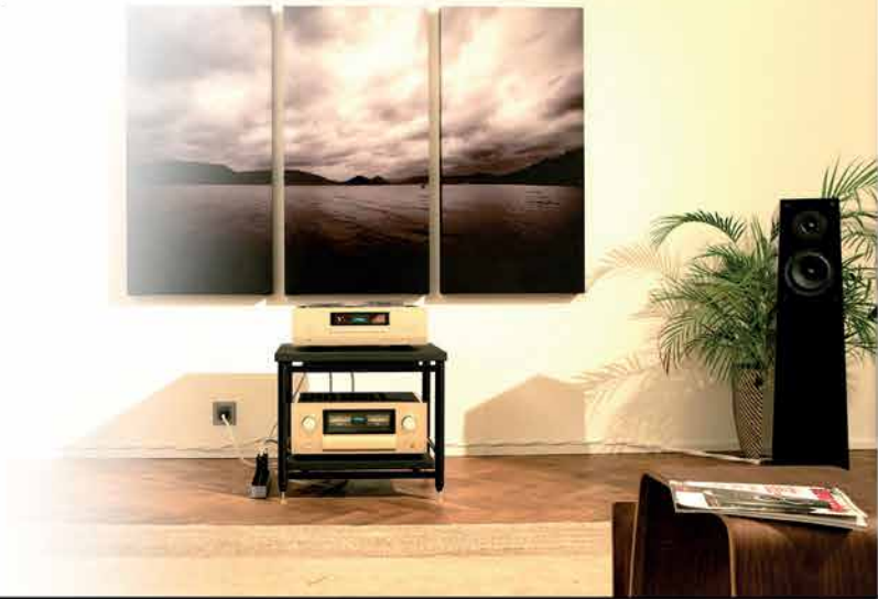
Image of 180x60cm, 120x60cm and 60x60cm models Ref.:MEL180, MEL120 and MEL060 (on the left) and three Ref.:MEL120 models applied (ambient image) with MOTIF® finishing.