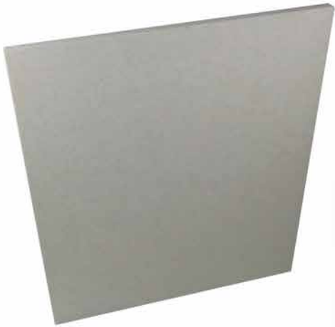
Image of the PETREV06/24 model (on the left) and magnified texture on the background.