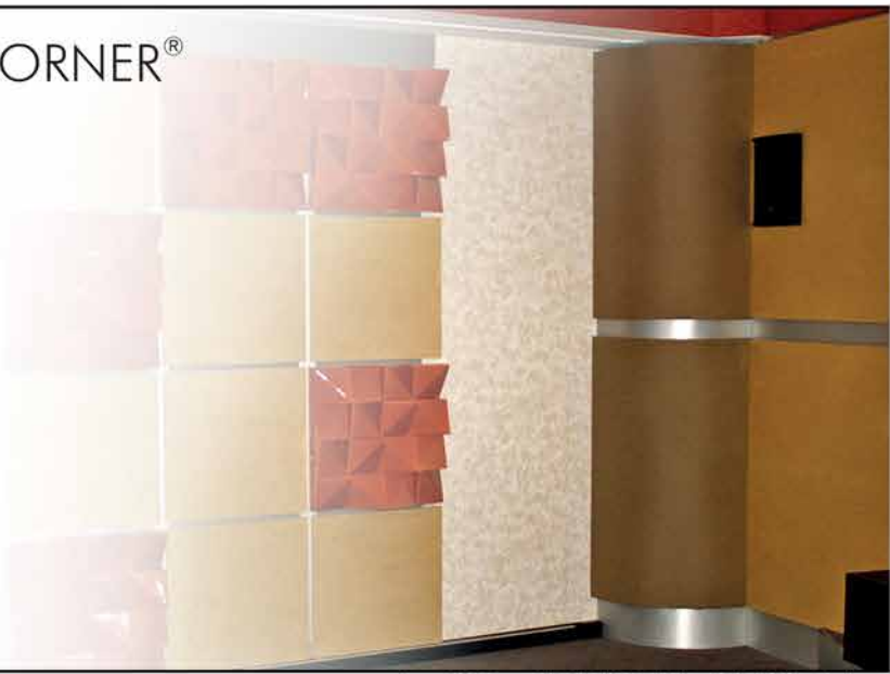
Image of 120x50cm model Ref.:RC0120 (on the left) and Ref.:RC0120 (ambient image).