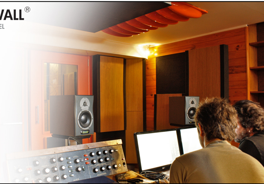
Image of 120x60 model Ref. SLW120 (on the left) and Ref. SLW120 applied (ambient image)