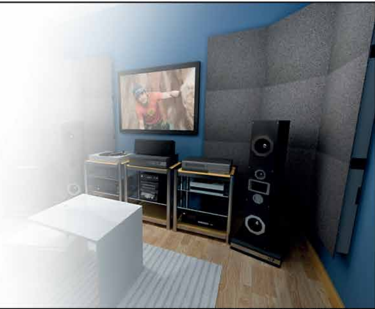
Image of 60x60cm model Ref.:BXA060 (on the left) and Ref.:BXA060 (ambient image).