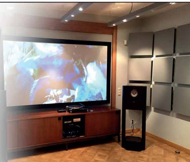
Image of 60x60cm model Ref.:WBA060 (on the left) and 60x60cm models applied (ambient image).