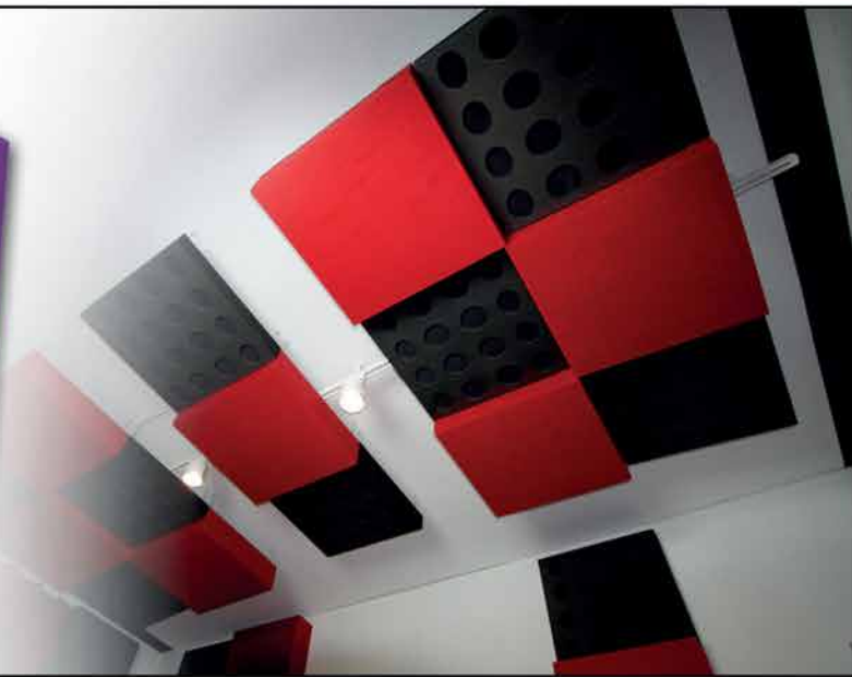
Image of 60x60cm model Ref.:WAL060 (on the left) and Ref.:WAL060 (ambient image).