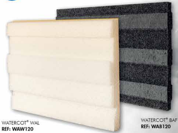
WATERCOT® WAL REF: WAW120